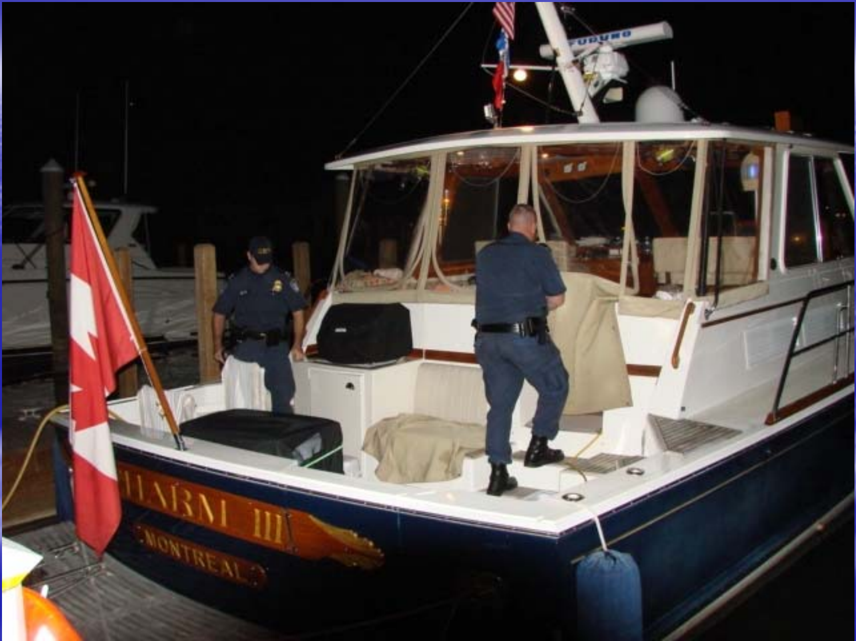
Source for information: Reporting Requirements for Private Boat Operators in the Great Lakes Region 2008